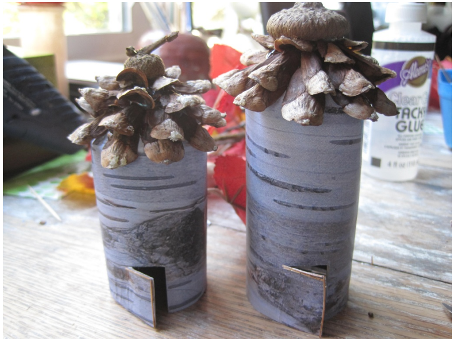
Completed Fairy Houses