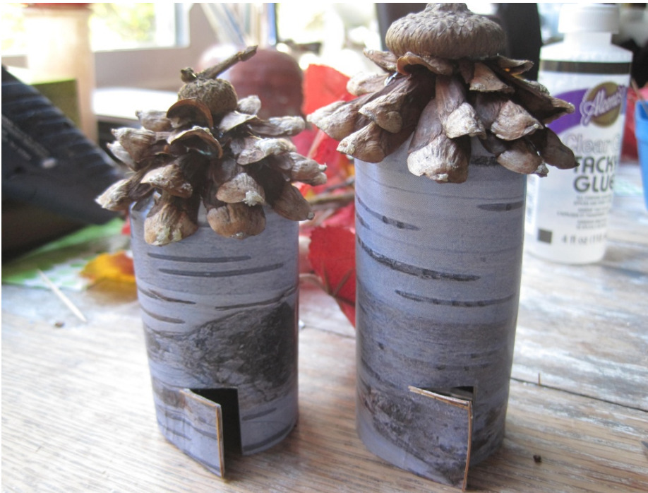
Completed Fairy Houses