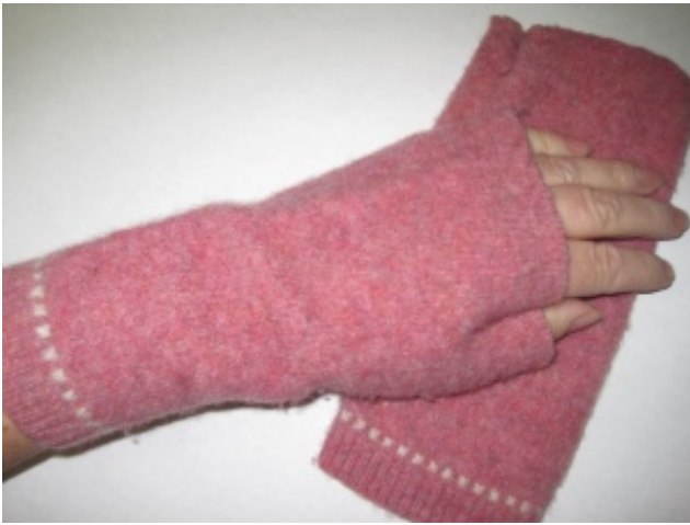
Finished Wrist Warmers